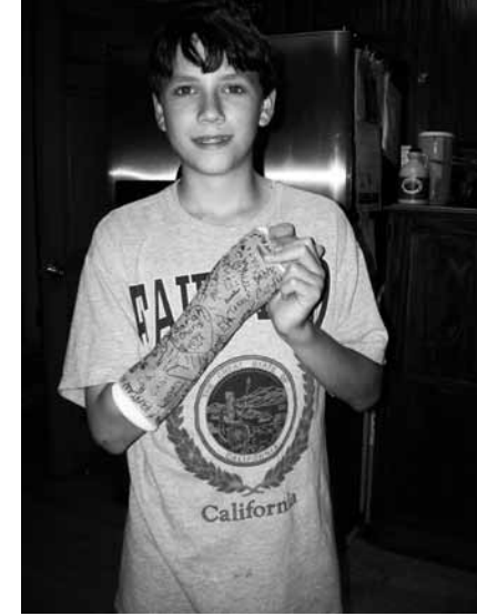
a true underdog thing.